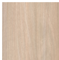
ASH C16 Warm white oiled

We treated this wood with our 'Mocca brown oil'.