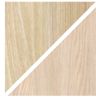
ASH C6 / OAK C6 White oiled

We treated this wood with our 'Natural oil'.