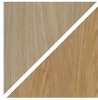
ASH C4 / OAK C4 Natural oiled

C3 are only made for products without patination.